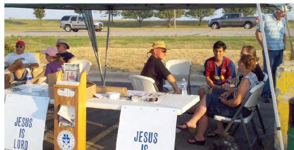
Our tent at the Car Show