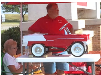
Pedal Car Raffle—half of the proceeds ($600.00) went to the new chapel project.