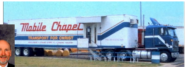
Master's Inn Mobile Chapel Rochelle Travel Plaza Petro I-39, State Highway 38

Leading truck drivers as well as the trucking community to Jesus Christ and helping them grow in their faith