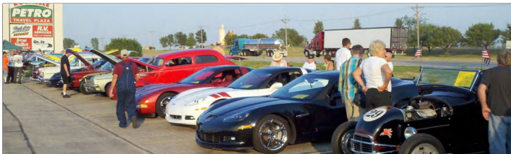
Petro Car Show